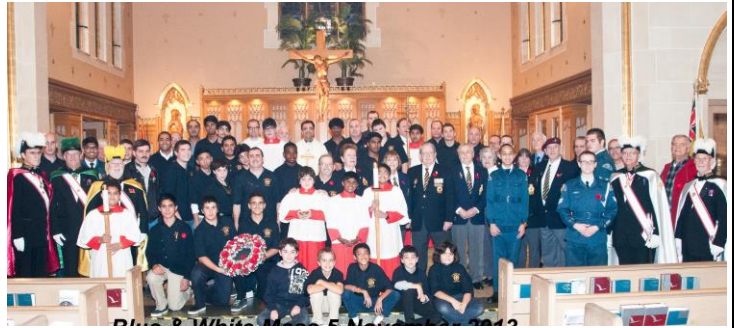
Blue & White Mass-November 5, 2013 St. Dominic Savio Squire Circle # 5217