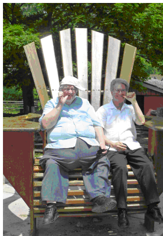
Would you bare your soul to these guys?